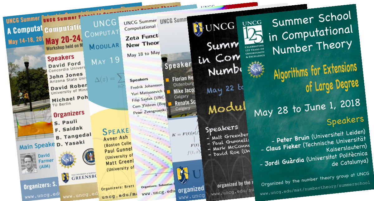
Posters for previous UNCG Summer Schools in Computational Number Theory.

The summer school aims to complement the traditional training that graduate students receive by exposing them to a constructive and computational approach to objects in number theory.